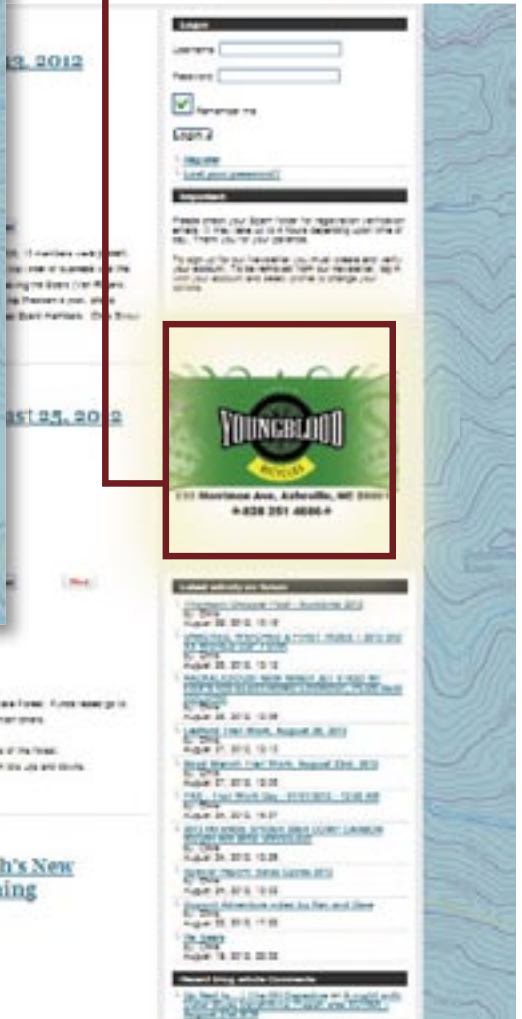
Rotating Tier 3 Sponsors: 300x291